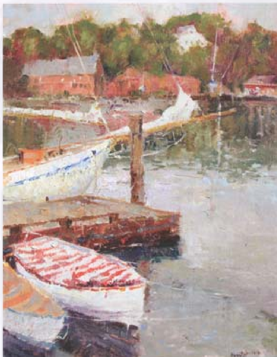
ROCKPORT MORNING, OIL ON CANVAS, 24 X 18"