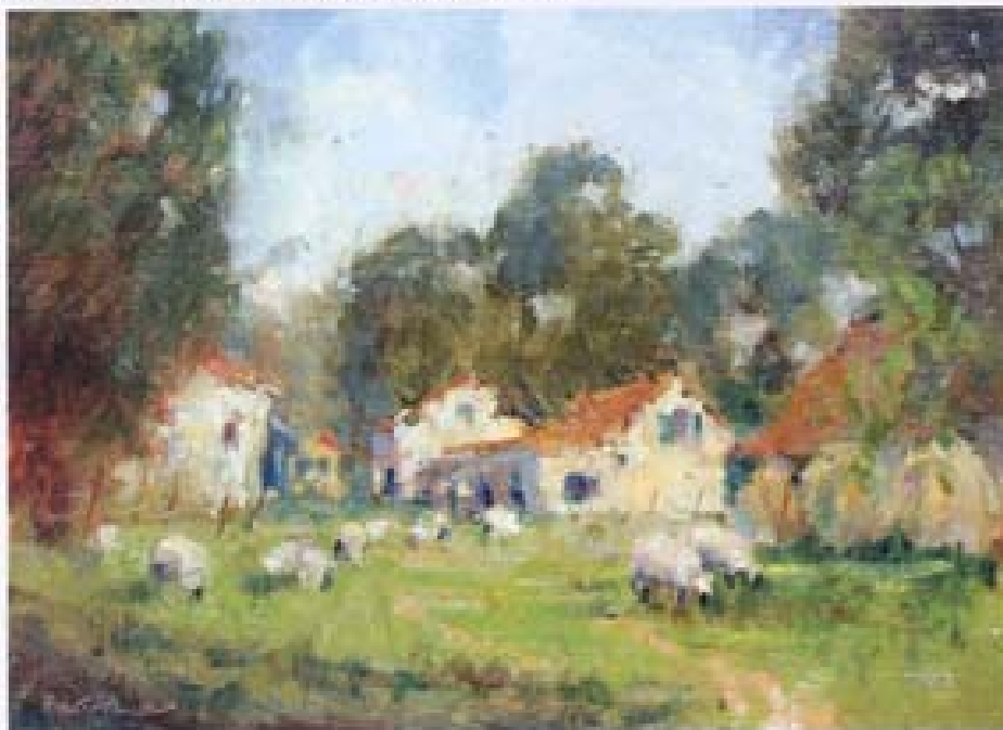
NORMANDY FARMYARD, OIL ON CANVAS, 12 X 16"