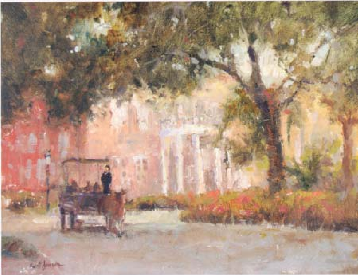
RIDE IN SAVANNAH, OIL ON CANVAS, 18 X 24"